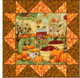
Block 3: Make four blocks.

5. Sew one of the units created in Step 4 to the remaining edges of "H", making sure that the orange "arrows" point away from "D".