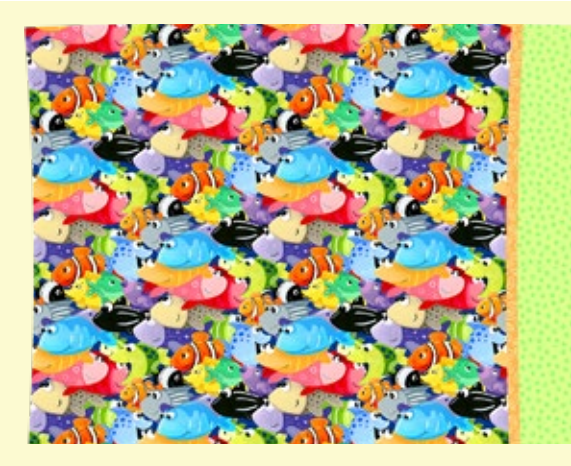
Standard Size Pillowcase

Includes complete instructions and link to a detailed video tutorial.