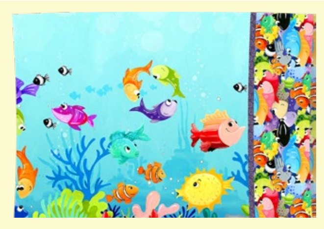
Standard Size Pillowcase

Includes complete instructions and link to a detailed video tutorial.