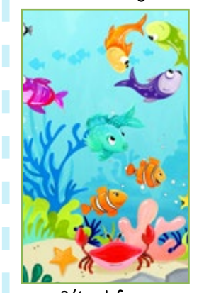
3/4 yd for pillowcase body