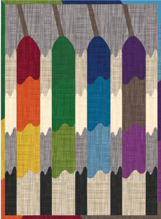
Designed by Debbie Fenton 20" x 27 1/2"