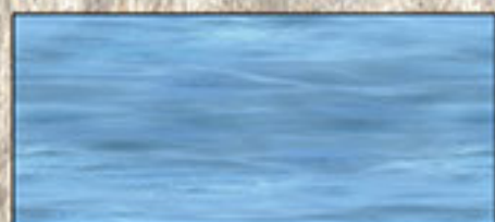
H 30166-444 1/2 yard (FQ)