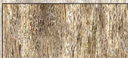
F 30165-211 5/8 yard