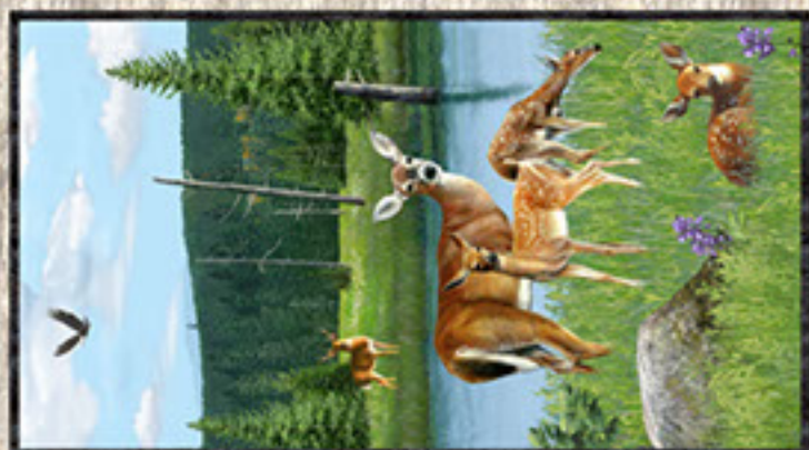
A 30160-742 2/3 yard (1 panel)