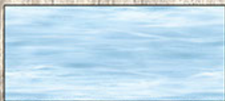
I 30166-441 Backing Only 3 1/4 yards (Non-directional) 4 1/8 yards (Directional)