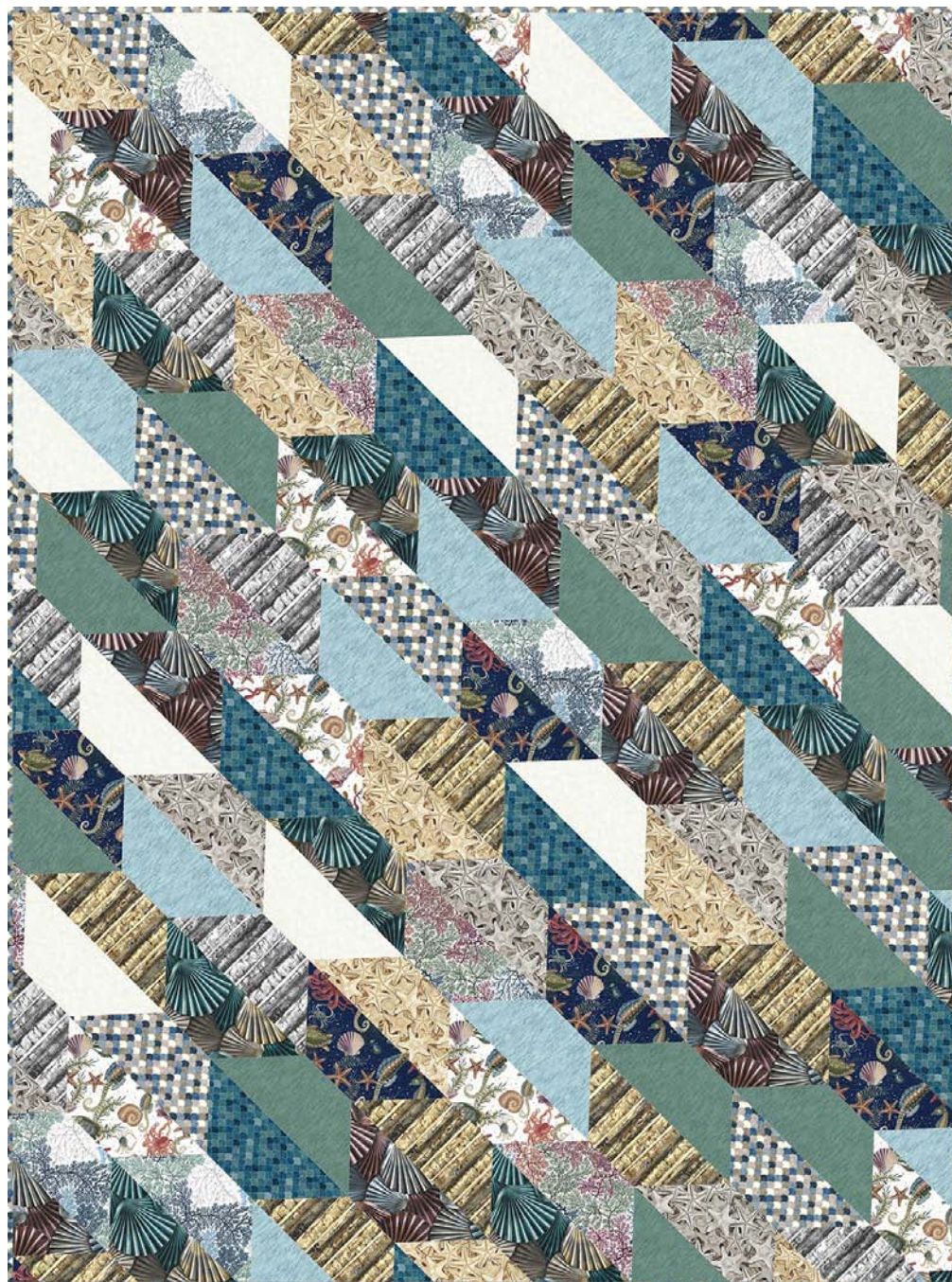
P7620 18S-Royal Silver

Quilt design by Wendy Sheppard, featuring Coastal Drift and Diamonds in the Sky. Is it a hexi? Is it a tumbler? Yes, it's the best of both put on point for even more pizzazz. Quick and easy so it will be a favorite.