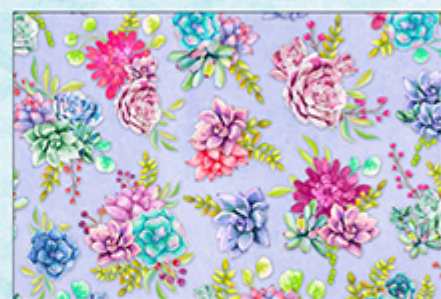
Fabric C 1665-33831-643 1/4 yd. (FQ)