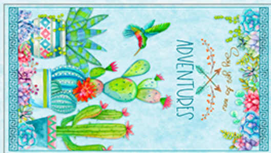
Fabric A 1665-33828-473 2/3 yd. (1 Panel)