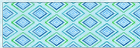
Fabric H 1665-33836-474 5 yds. (backing only)