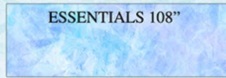
OR Fabric H 1054-2079-406 2 yds. (backing only)