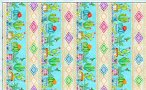
Fabric B 1665-33829-427 1 1/2 yds.