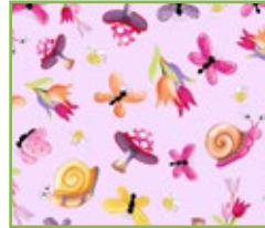
1/4 yard for cuff