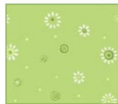
2" for flange