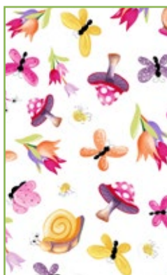
3/4 yd for pillowcase body