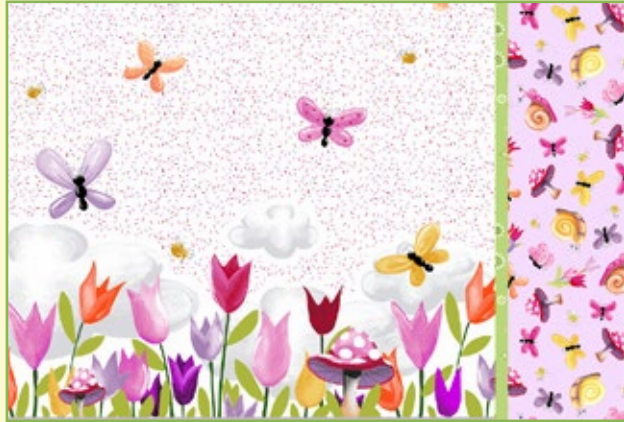
Standard Size Pillowcase

Includes complete instructions and link to a detailed video tutorial.