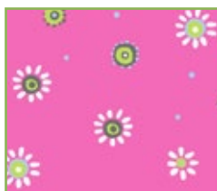
2" for flange